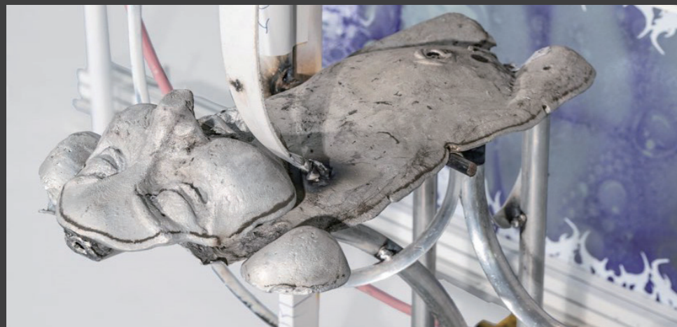
大卫·杜阿尔，《金丝雀雕塑》（局部），2022。材质：铸钢、铁、铝、金属、丝网印刷玻璃、亚克力、173 x 108 x 130 cm。 David Douard, Corsax / Light (detail), 2022. cast aluminum, iron cage, aluminum, metal screen printed fabric, glass, steel, 173 x 108 x 130 cm.