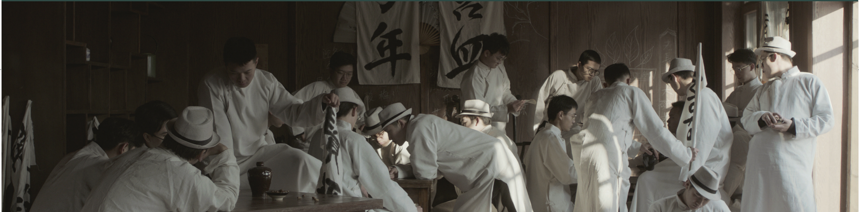
王拓, 《通古斯》, 2021, 彩色有声单频 4K 影像, 66 分钟, 致谢艺术家和空白空间。由上海当代艺术博物馆委任创作。 Wang Tuo, Tungus , 2021, single-channel 4K video, color, sound, 66'00". Courtesy the artist and WHITE SPACE BEIJING. Commissioned by Power Station of Art (Shanghai).