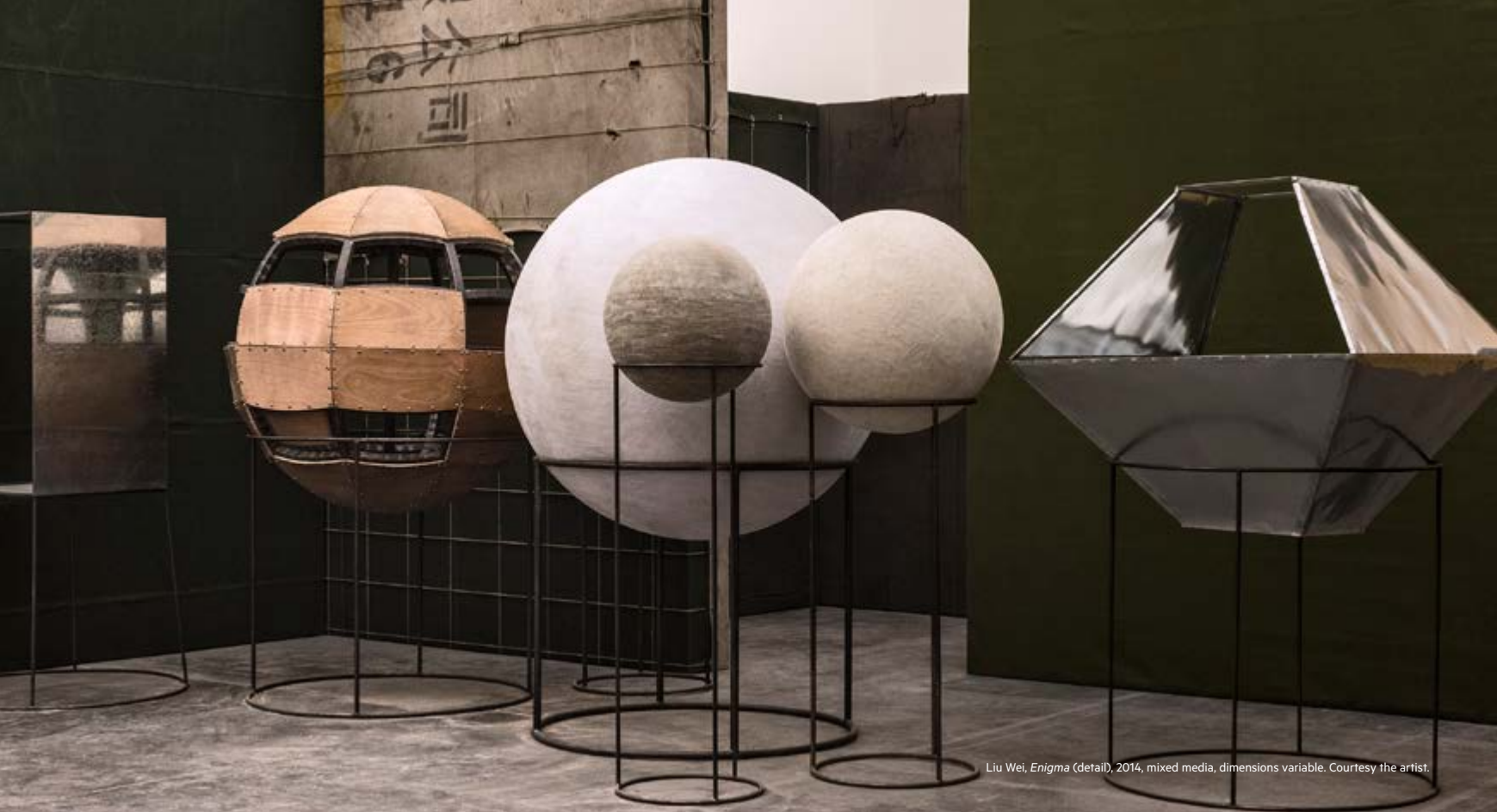
Liu Wei, Enigma (detail), 2014, mixed media, dimensions variable.