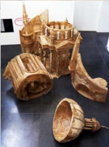
Liu Wei Love It, Bite It No. 3 2014, oxhide, wood, steel dimensions variable.

Liu Wei first used oxhide in his work Love It, Bite It (2006), for which the artist recreated iconic venues of global prestige and power—the Pentagon, St. Paul's Cathedral, the Tate Modern—out of this atypical medium. After seeing his dog gnawing on an ox hide chew toy, Liu began to consider the relationship between animal urges and human desire for power, his sculptural practice a metaphorical strategy for reducing the conceptual distance between these parallel yens. The oxhide constructions are symbols of structural frailty, the tendency of power to purport ideological infallibility that paradoxically implies weakness. Placed together, the buildings' competing claims to centrality and authority cancel each other out. Love It, Bite It No. 3 , on view in the Lobby, is the latest work in this series. The visual style of the work reflects an interest in the iconography of religious architecture, extending Liu's material investigations to new ideological territory while scaling the series up from model to life-size.